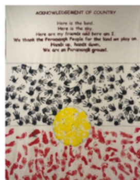
Alive Early Learning Mt Barker