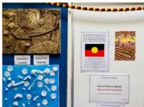
Seaton Community Children's Centre