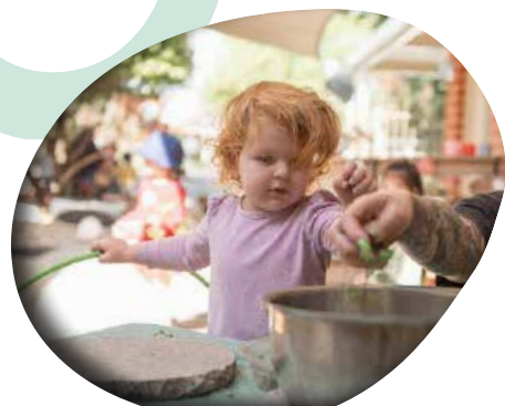
Educator Upskilling Naming is a Gift: Marte Meo