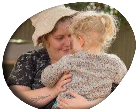
Family and Parenting Support Circle of Security Parenting