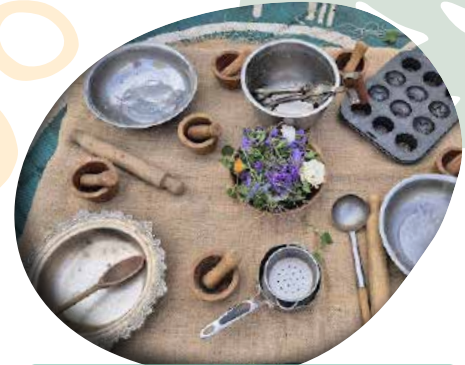
Family and Parenting Support Teach-Do-Learn: Parenting Program