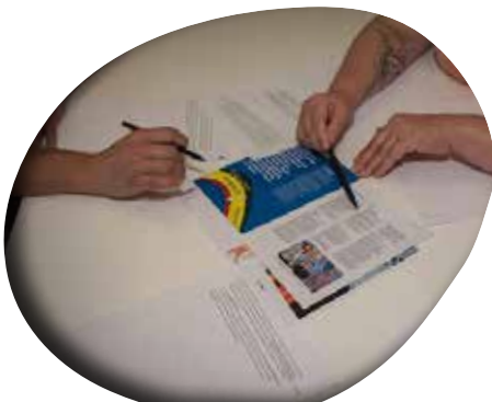
Leadership and Mentoring Leadership Coaching