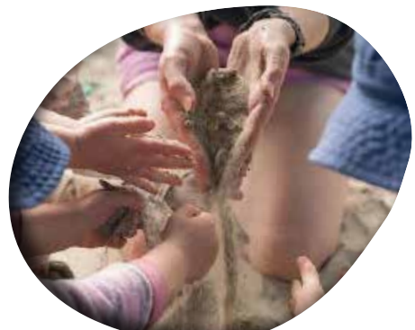
Educator Upskilling Teach-Do-Learn: Facilitator Upskilling