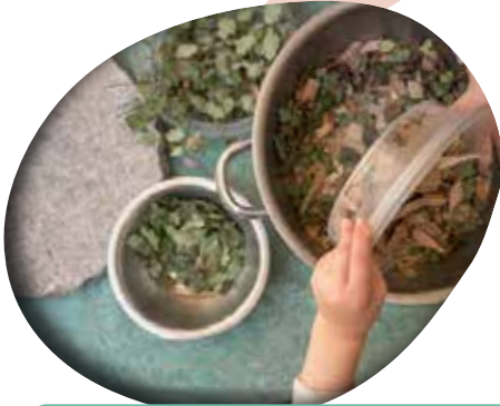
Educator Upskilling Pedagogy in Practice Series