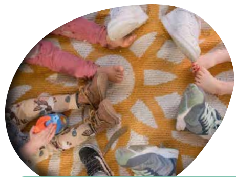
Educator Upskilling Understanding Childhood Trauma and Behaviour