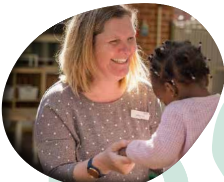
Educator Upskilling Circle of Security Classroom