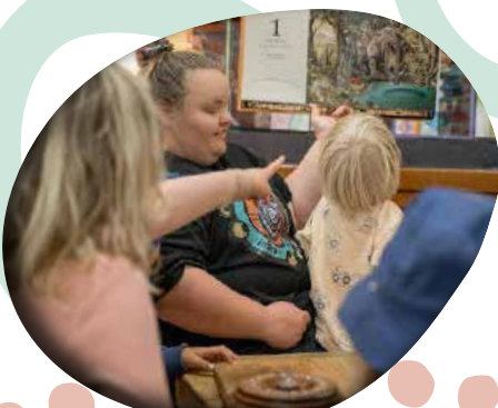
Educator Upskilling Learning Language and Loving It: The Hanen Program