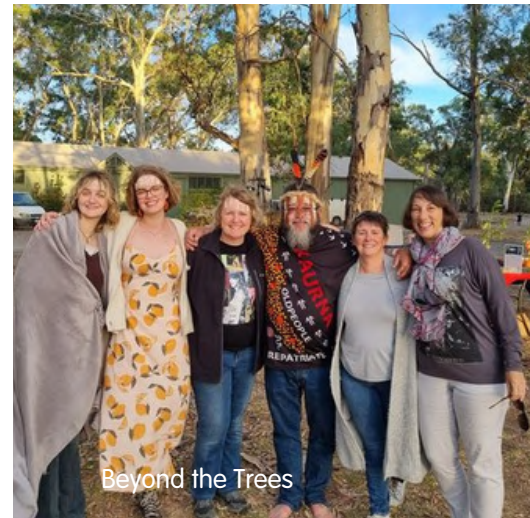
Beyond the Trees