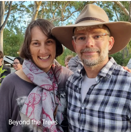
Beyond the Trees

Gowrie SA purchased discounted tickets to the Adelaide Festival through Open House's Tix for Next to Nix program to support Aboriginal and Zenadth Kes staff, our stakeholders and our parent community to attend shows like Guuranda and Baleen Moondjan. We are grateful to have the opportunity to support community to attend these events and to support Aboriginal and Zenadth Kes artists.