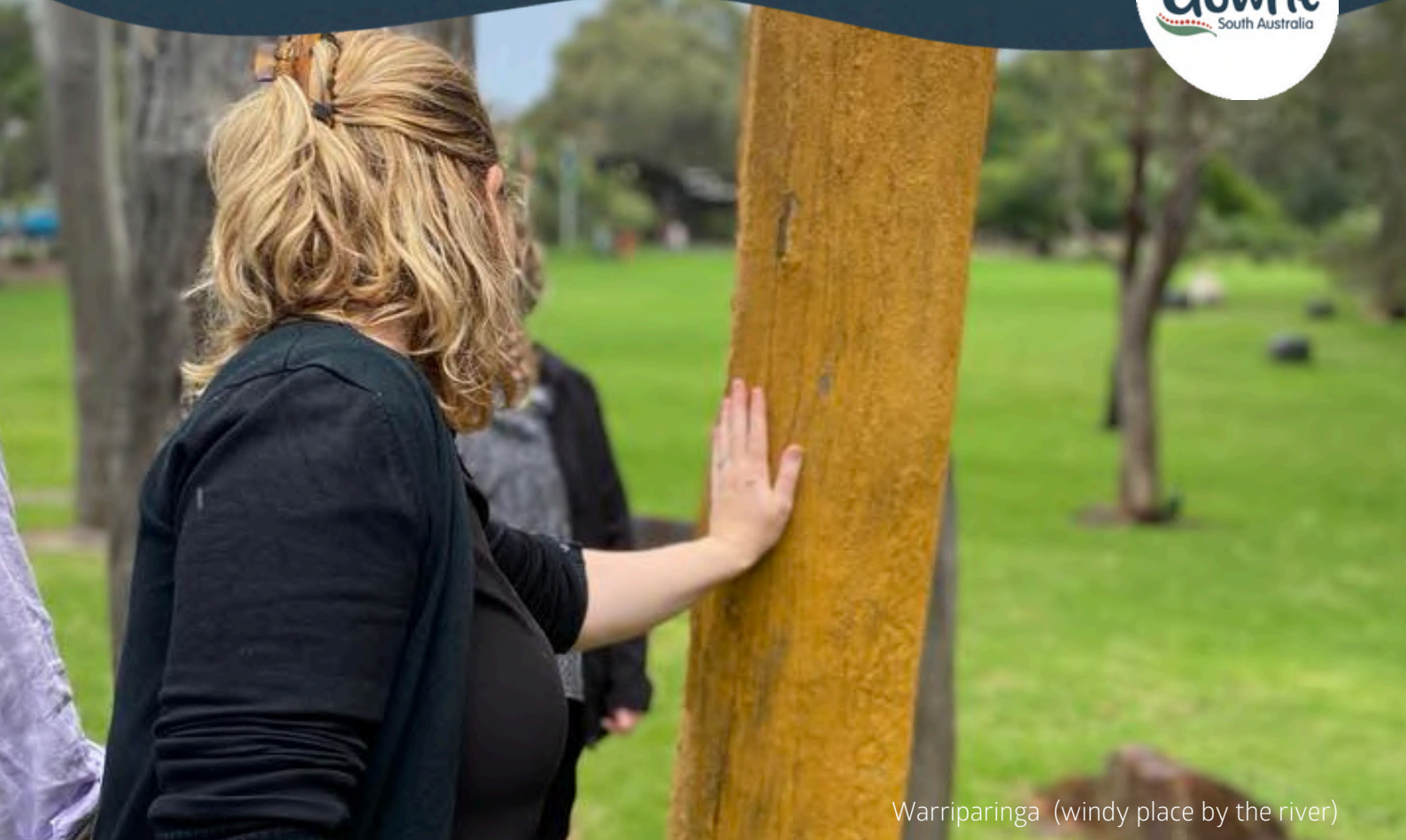
Warriparinga (windy place by the river)