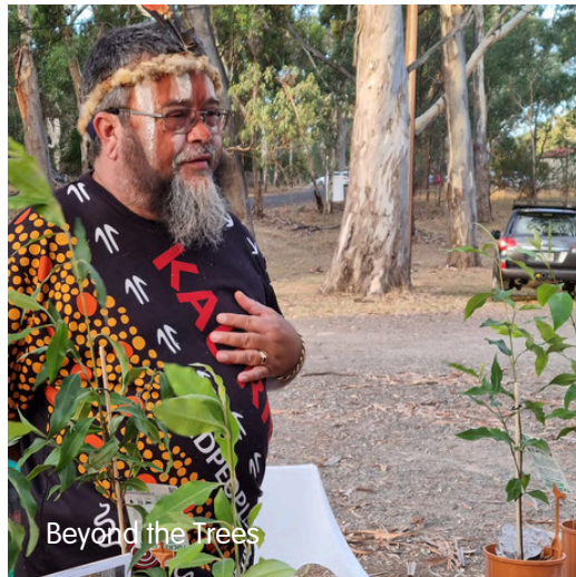
Beyond the Trees