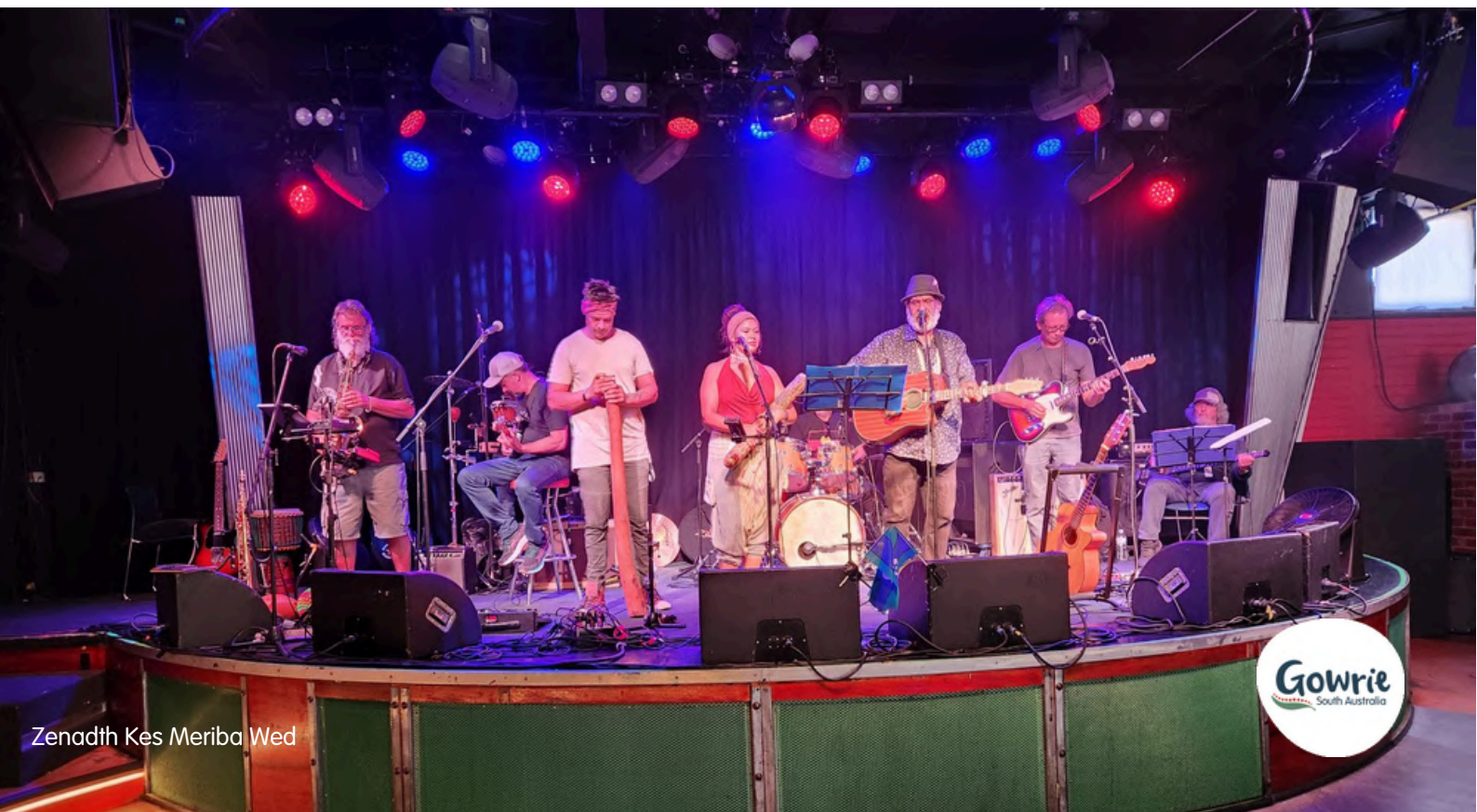
Zenadth Kes Meriba Wed